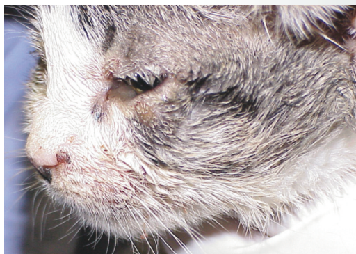
Figures 1 and 2 Marked facial edema, extensive hair loss, oozing and ulceration of the skin in two cats affected by VS-FCV. Less virulent strains can cause slight crusting on the muzzle and feet.