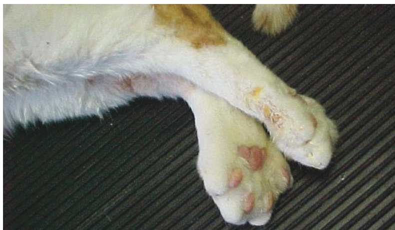
Figure 3 Hair loss, crusting and edema of the feet in a cat with VS-FCV.

Acutely infected cats generally shed virus for up to 2–3 weeks, although some shed persistently for varying periods, and re-infection is common. 1,4,15,16 Carriers are widespread and important in the epidemiology of the disease; the highest prevalence is in groups of cats (25–40%), and lowest in household pets (~10%). 14 Disease is more prevalent, therefore, in boarding, shelter facilities and breeding colonies, 4,17,18 and tends to occur in young kittens following the decline of maternally derived antibodies (MDA), though subclinical infection may occur while MDA are still present. 3,4