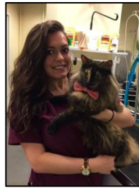
Nicole Rowbotham Clinical Practice Scholarship